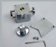
Adapter for wires/screws or small parts with a diameter of 3-10 mm