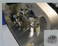
Adapter for wires with a diameter of 1-3 mm