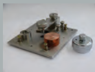
Small Parts Adapter Kit

Material control presents a wide range of analysis requirements. Two specific challenges: adjusting to samples' differing shapes and sizes, and optimizing positioning on the spark stand. Fortunately, SPECTROMAXx's adapter kit offers a variety of flexible, easy-to-use solutions.