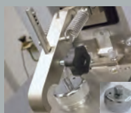
Adapter for small pieces